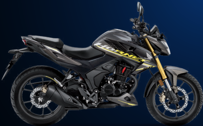
Matte Axis Grey Metallic