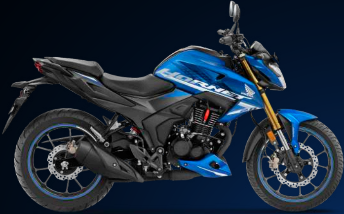
Athletic Blue Metallic