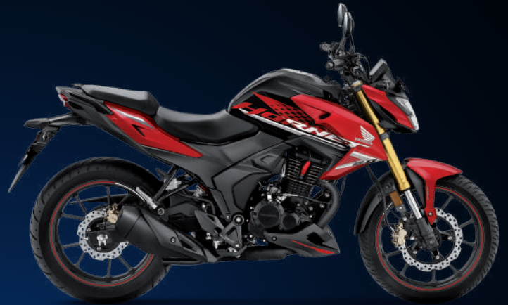
Radiant Red Metallic